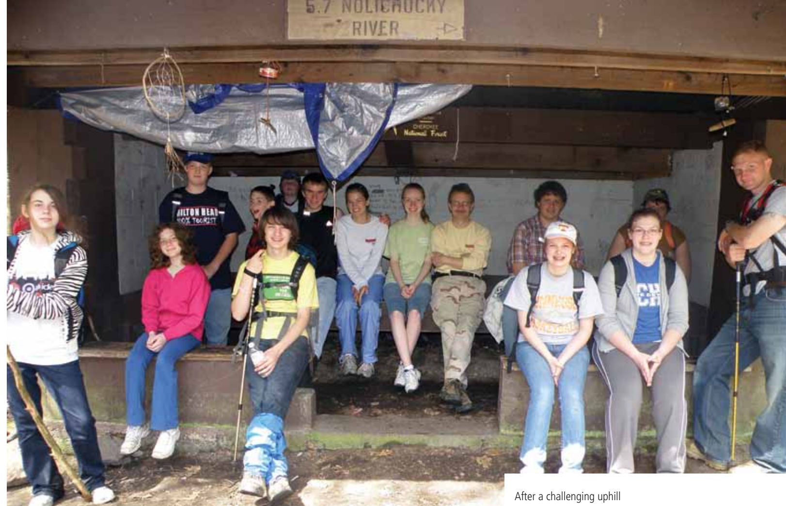
After a challenging uphill section, the group takes a much needed lunch break at No Business Knob Shelter.

outdoor privy, although nobody was in a hurry to line up and use it. This section was relatively easy, and ran through mostly dense forest.